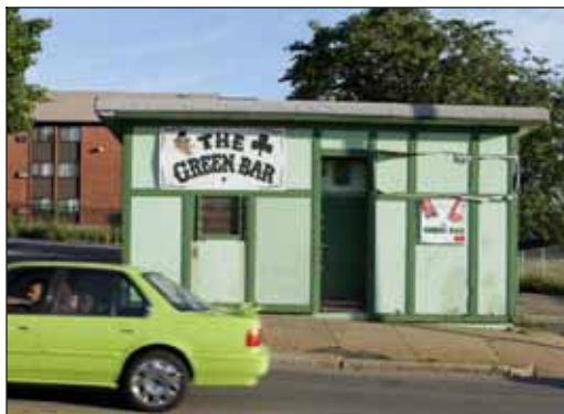
THE PROVIDENCE JOURNAL CONNIE GROSCH

The Green Bar on Westminster Street, in Providence, will be shut down until June 27, when the city's Licensing Board will hold a hearing.