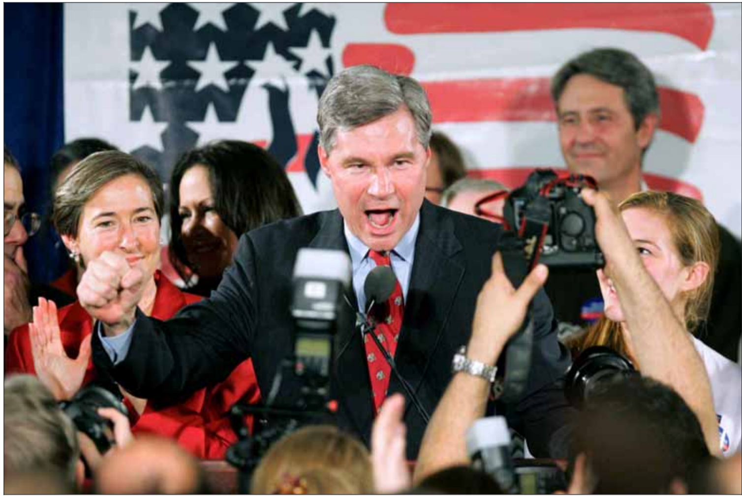
Surrounded by his family, Sheldon Whitehouse celebrates his victory over U.S. Sen. Lincoln D. Chafee last night at the Providence Biltmore. "I want to thank the people of Rhode Island for putting their trust in me," Whitehouse says.

By late last night, the Democrats were almost halfway to