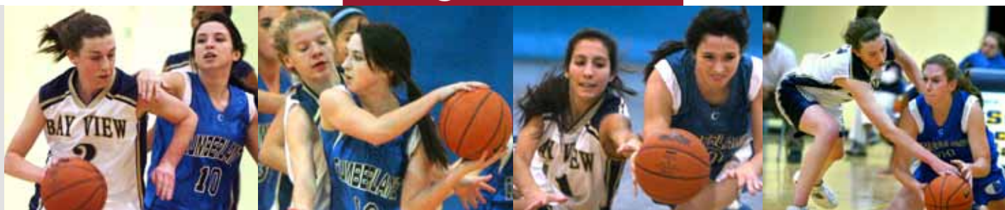
BAY VIEW FLEXES MUSCLE VS. CUMBERLAND: View the gallery at HSGameTime.com/rhodeisland

Tell us what you think at projsports.com/patriots