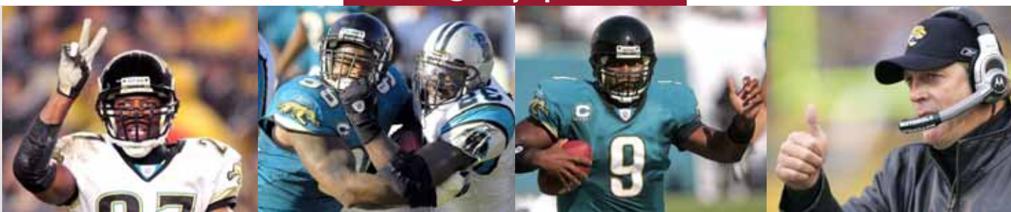
MEET THE JACKSONVILLE JAGUARS: View the gallery at projosports.com/patriots

Tell us what you think at projosports.com/patriots