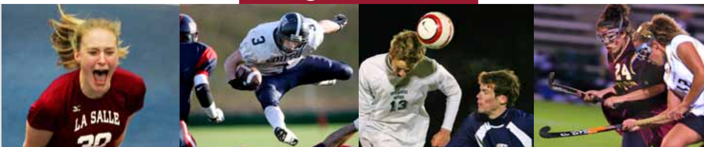
SCENES FROM THE FALL CHAMPIONSHIP GAMES: View the gallery at HSGameTime.com/rhodeisland

Send in your answer at projosports.com/patriots